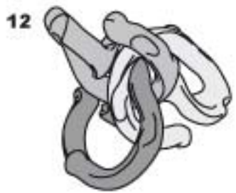
12 The top end of the "W" piece is clear of the bundle. Now, prepare to join the top end of the "HANAYAMA" piece to the hollow of the "W" piece.