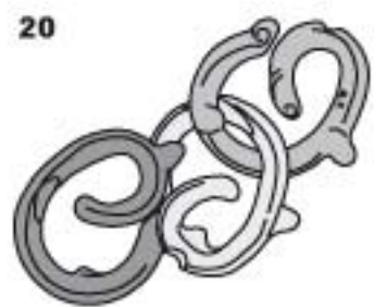
20 All that is left to do is to remove each piece starting with the "HANAYAMA" piece.