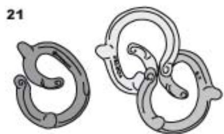
21 Once the "W" piece and the "HANAYAMA" piece are removed, all 3 pieces can be separated.