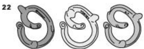
22 After observing the differences of the 3 pieces, put them back together, paying attention to the order in which you joined them.