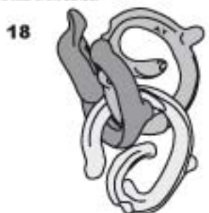
18 The trick here is to join the top end of the "W" piece to the hollow of the "VORTEX".