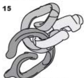
15 The top end of the "HANAYAMA" piece is clear of the bundle.