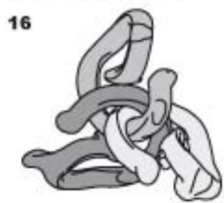
16 The tails of the 3 pieces will then look like they are tangled together.